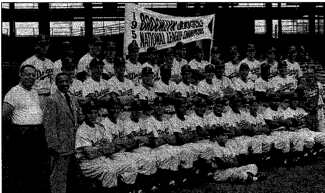
The Brooklyn Dodgers, National League Champions in 1953.