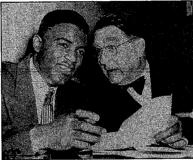
Jackie Robinson and Branch Rickey signing the contract.

Rickey sent scouts to Cuba, Puerto Rico, and the Negro Leagues, where they found Jackie Robinson. Robinson was smart and educated. He was an aggressive player with great balance who could quickly change direction. Branch Rickey thought Jackie Robinson just might be the man he was looking for to join the Brooklyn Dodgers team.